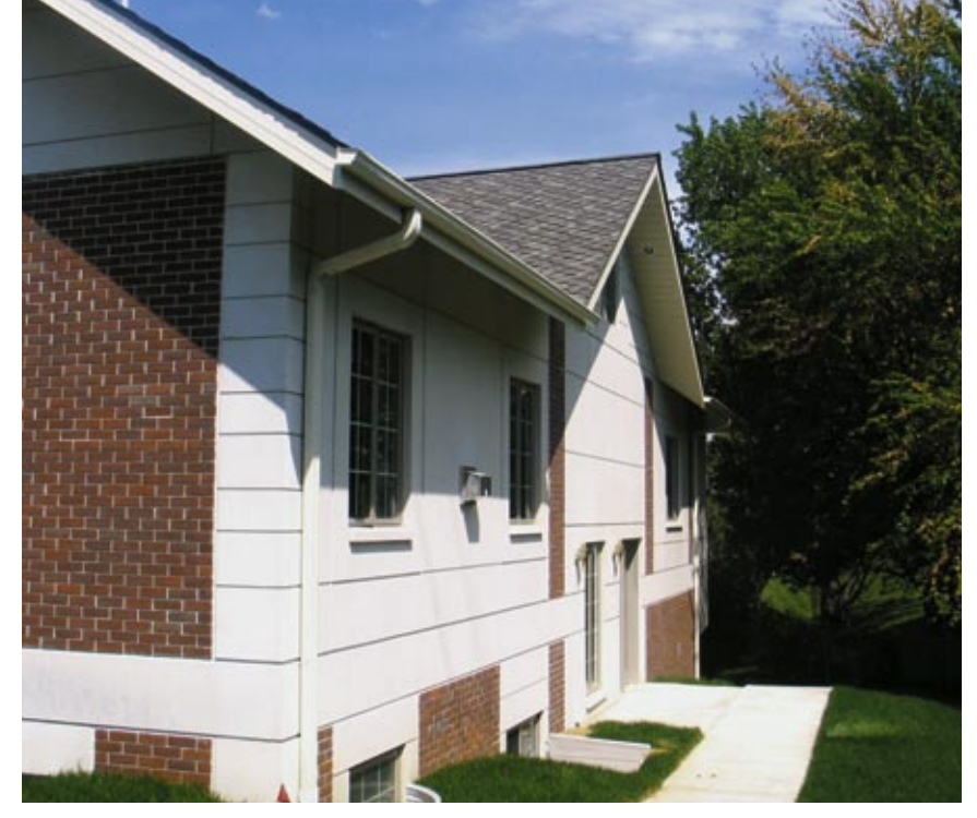
Precast's ability to provide an aesthetically pleasing look while offering other advantages gives it great potential for future bousing projects.

Tadros names other significant benefits that the design provides. These include: