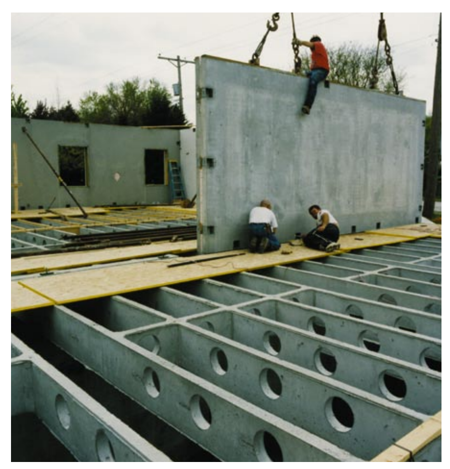
Precast concrete flooring consists of longitudinal panels spaced 2 feet apart, which provided spans up to 40 feet in the basement.

would have worked, and it definitely would have provided more protection to the homeowners," says Tadros. As it was, the final design features a 35-foot precast concrete roof beam, with the beams anchored to the walls and the wood trusses anchored