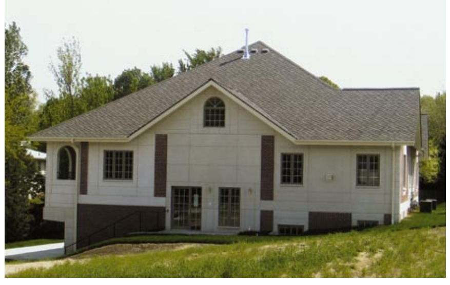
This duplex in Omaha, Neb., features precast concrete wall panels, flooring and roof beams, producing a sturdier bome that's pleasing to the eye.

The design focused on three new precast concrete design elements: a patented design for an insulated sandwich wall panel, a floor-joist panel and a roof beam that could be expanded into the entire roof structure. Using these three together, Tadros says, creates a design that offers great potential for virtually all regions of the country. To prove this, the group created a duplex in Omaha to serve as a demonstration